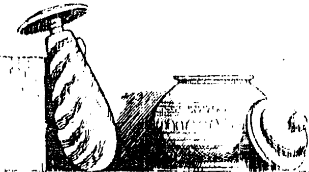
Toropii kaliangan pakakas men niwawau na watu pualam

3 Sarataa ai Yesus na Betania, na laigan ni Simon men kustaon mbaripi, taka a wiwine sa'angu' nanga-wawa botor men watu pualam, buke' a minamina' narwastu. Minamina' narwastu iya'a alayo' tuu' a angga'na gause sianta baurna. Kaekae' kumaan i Yesus, ia pula'imo wiwine iya'a a talopna botorna, kasi nitim-